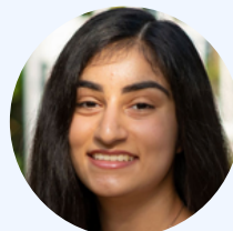
Richard G. Zimmerman Scholarship