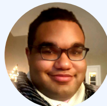
Spring Lewis Scholarship