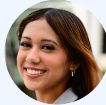
Wes Vernon Broadcast Scholarship