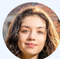
Summer Lewis Scholarship